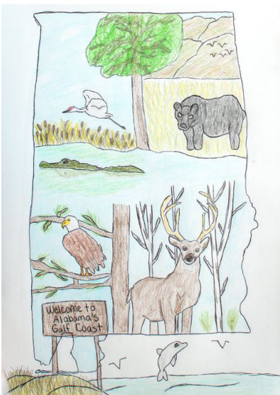
2021 Art Contest Submission

Alabama is one of the richest bio-systems in our country but continues to score poorly in several areas of conservation. The Conservation Department is focusing on programs to provide the community with a comprehensive network of local and regional conservation efforts; aid the community in understanding the issues facing wildlife on a local and global level; and create an understanding within the community of the importance of preserving habitats for native species. A blog was started in September that continues to publish weekly with conservation information and activities, visit our website or Facebook page to read blog posts. Two programs will launch in the next few months, FrogWatch USA – a program that identifies environmental health on a local level and Pollinator Habitat Conservation. These efforts will be followed by a Gray Bat Conservation Initiative to begin in late 2021. Also, keep an eye out for our conservation database that is launching soon.