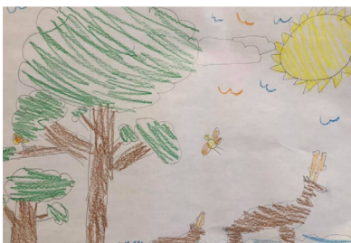
2021 Art Contest Submission