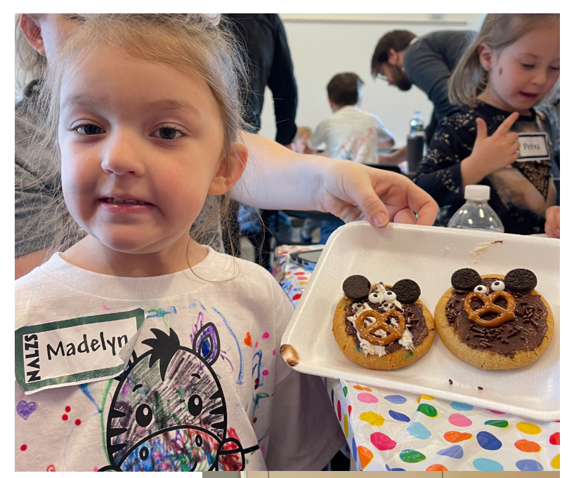
Above and right: Children take part in the NALZS Be a Little Wild: Little Tykes session in March at the Madison Public Library

Learn about our volunteer opportunities at <u>NALZS.org/volunteer</u>