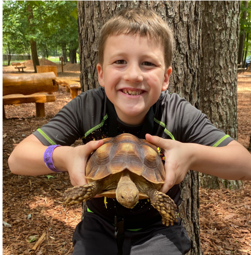
NALZS ambassador animal Twickenham visits camp on the sunniest days and loves to learn with the campers.